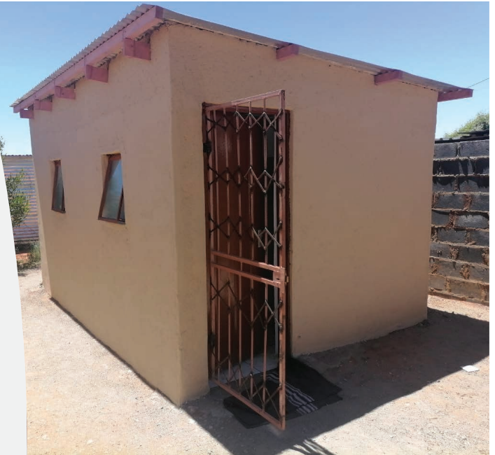
Completed lavatory structure

We are sure that the children attending this education centre will enjoy heading back to a much-improved school for a year of fun and learning!