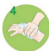
Rub each wrist