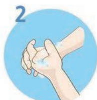
Rub palm to palm with fingers