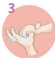
Rub tips of fingers