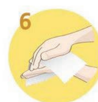
Dry your hands