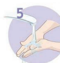
Rinse your hands