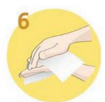
Dry your hands