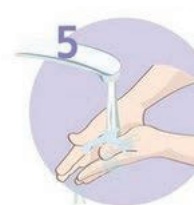
Rinse your hands