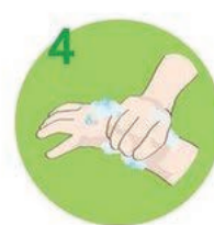
Rub each wrist