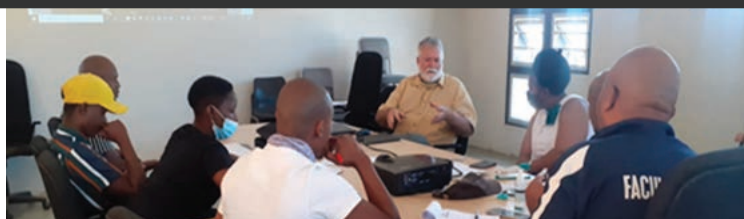
Entrepreneurs prepping for the 'Pitch Deck'

Local entrepreneurs who are part of Matla A Bokone's Enterprise Development Programme have successfully completed 'Phase 2' of the programme.