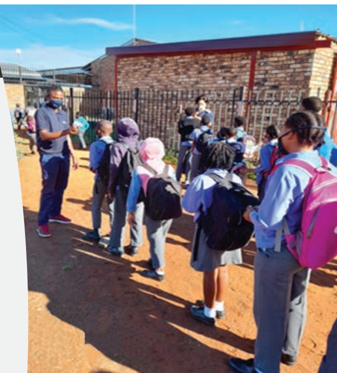
Temperature Screenings at IXunkhweza Combined School

The second phase, set to start in the first quarter of 2021, will focus on integrated school health screenings which include Vision and Hearing Testing, Oral Health Screening, Nutritional Status Assessments and other health education initiatives.