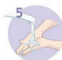
Rinse your hands