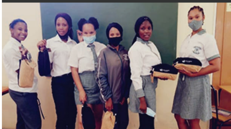
Learners from Barkly West High School with their toiletry packs

In collaboration with the Department of Education, as part of Matla A Bokone's Hearts and Minds Programme , toiletry packs were donated to matriculants attending Spring School Camps. A total of 19 local schools and 800 learners benefitted from this initiative, which aimed to maintain social and personal dignity in learners attending the camps.